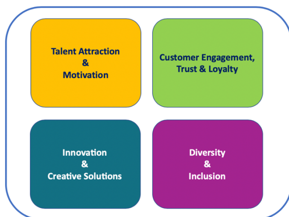
Lifter Leadership Helps Address 4 Major Corporate Needs

Lifter Leadership intentionally combines practicable thought-leadership from two domains - Business Performance and Human Flourishing. Most corporate solutions are focused either on business performance or human flourishing, leaving it to the individual to synthesize the two. This bifurcated approach causes a disconnect for employees, resulting in disengagement, workplace conflict, stress, lack of innovation and erratic front-line service to customers.